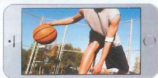
DribbleUp Smart Basketball