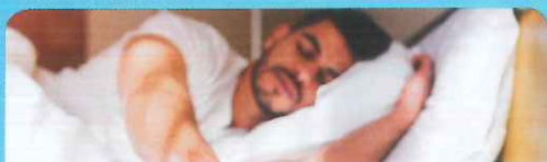
Sound Asleep Pillow

With this 9 present that I got for my birthday, I can record 10 moments while I'm diving and post them for my friends to see.