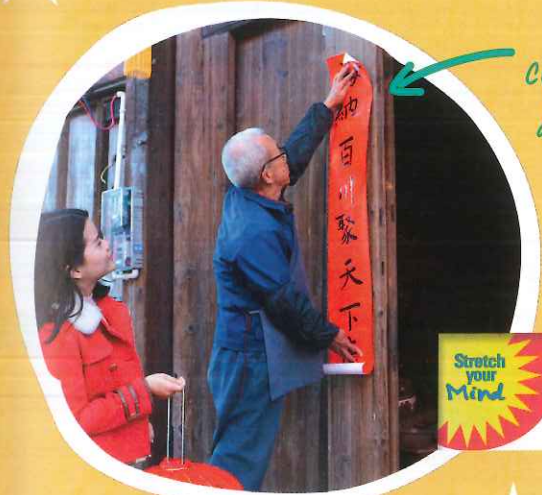
Chinese banner for good fortune and happiness