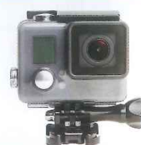
Underwater Video Camera

Making breakfast at 6.30 am can be fun! This 5 gift is both easy to use and very 6 !